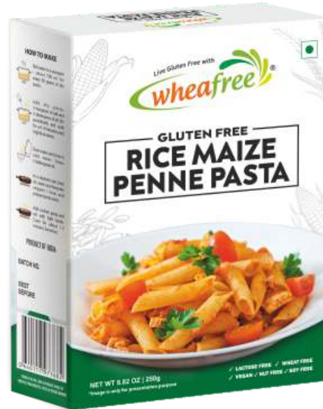
RICE MAIZE PENNE PASTA