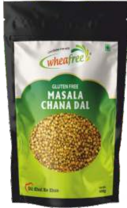
MASALA CHANA DAL